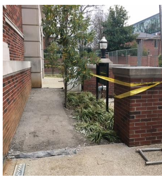
Resourceful temporary sidewalk, designed by UK Grounds, maintains ADA access to the King Science Library while protecting the tree.