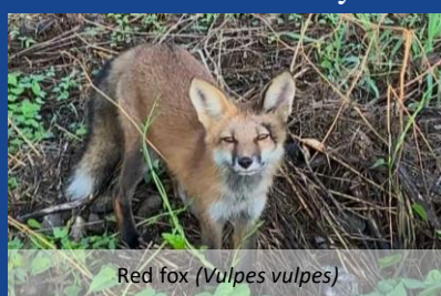
Red fox ( Vulpes vulpes )