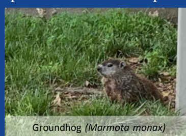
Groundhog ( Marmota monax )