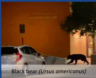
Black bear ( Ursus americanus )

Wildly PAWsible! Last week's historic black bear sighting on campus got us excited about campus wildlife. Here are some of the other furry friends spotted on or near campus recently.