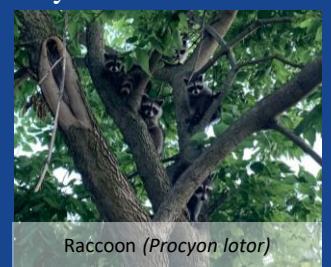
Raccoon ( Procyon lotor )