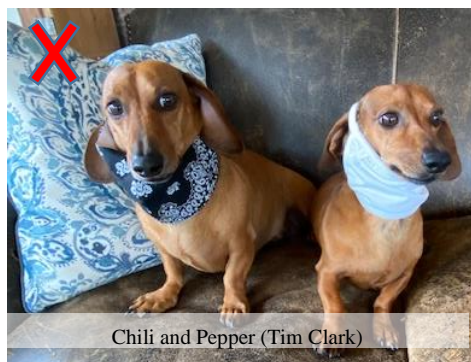
Chili and Pepper