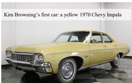
Kim Browning's first car: a yellow 1970 Chevy Impala