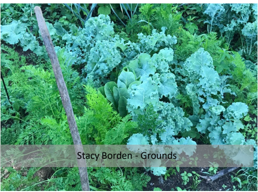
Stacy Borden - Grounds