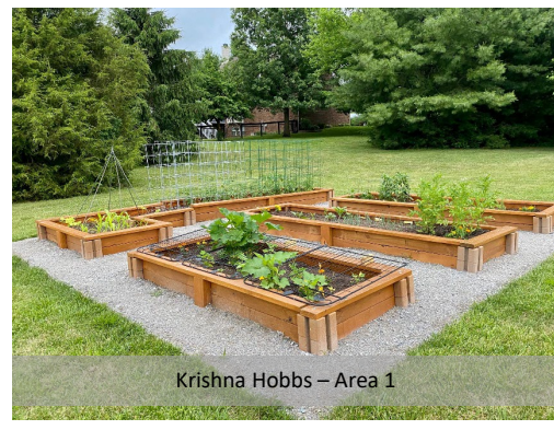
Krishna Hobbs – Area 1