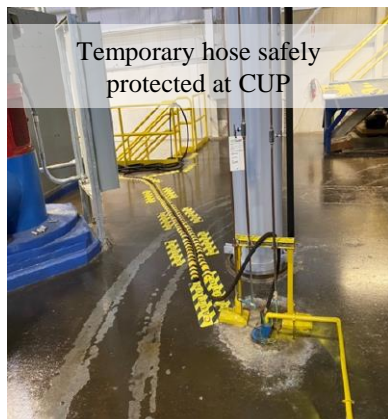
Temporary hose safely protected at CUP