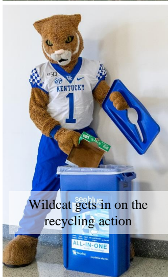
Wildcat gets in on the recycling action