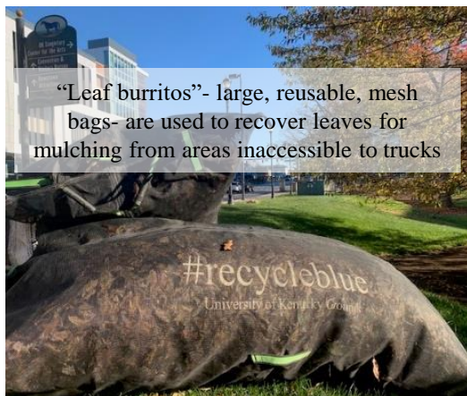
“Leaf burritos”- large, reusable, mesh bags- are used to recover leaves for mulching from areas inaccessible to trucks

Sunday, November 15, was America’s Recycles Day and UK has set an ambitious goal of recycling, reusing, or composting at least 50% of all waste produced on campus. Today’s Photo Friday collage highlights the people, programs, and equipment that are hard at work in pursuit of this goal. A big shout out to EVERYONE on the UK Recycling team and their friends and partners for all the excellent work on this front.