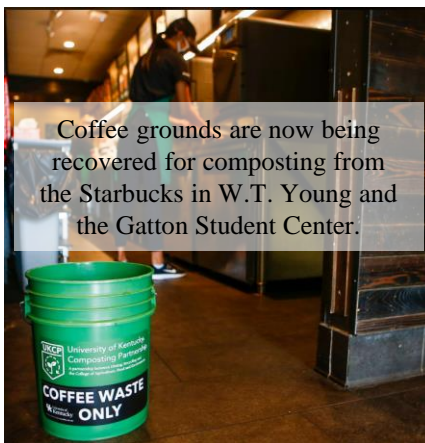
Coffee grounds are now being recovered for composting from the Starbucks in W.T. Young and the Gatton Student Center.