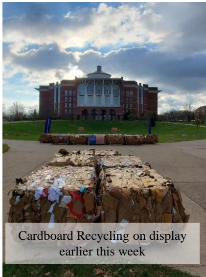
Cardboard Recycling on display earlier this week