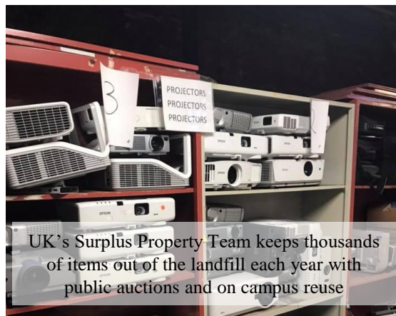
UK’s Surplus Property Team keeps thousands of items out of the landfill each year with public auctions and on campus reuse