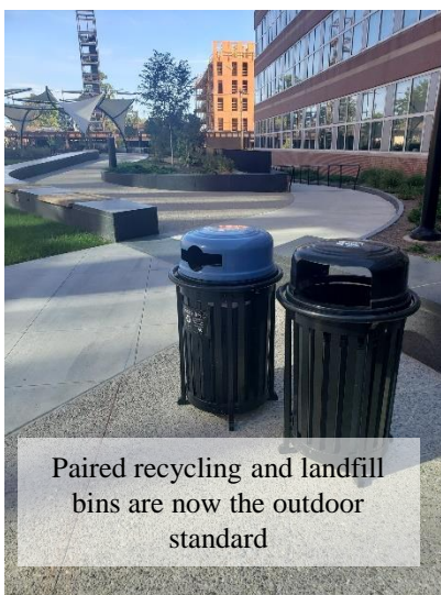
Paired recycling and landfill bins are now the outdoor standard