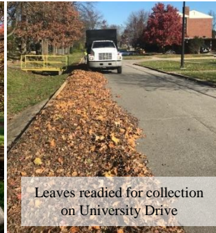
Leaves readied for collection on University Drive