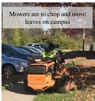
Mowers are to chop and move leaves on campus

There are more than 12,000 trees on campus. These trees provide beauty, shade, and tremendous ecosystem services like filtering air and water, preventing erosion, and sequestering carbon. This time of year, the trees also provide something else: leaves, lots of leaves. More than 370,000 lbs of leaves to be precise. While deciduous leaves are key components of nutrient cycling in natural forests, the 185 tons of leaves that fall on campus each year pose threats to other campus infrastructure including clogging stormwater systems, smothering turf, staining concrete, and creating slip and fall hazards. For these reasons, UK Grounds works hard each year employing a wide variety of tools and techniques (see photos) to collect the annual leaf fall. Once collected, the leaves are transported to LFUCG’s yard waste facility where they are processed into mulch that is available to the community. UK Grounds uses a combination of mulch and compost around campus trees to simulate the nutrient pulse that would have come from the leaves. THANK YOU TO OUR GROUNDS TEAM FOR TACKLING THIS MASSIVE CHALLENGE EACH YEAR!