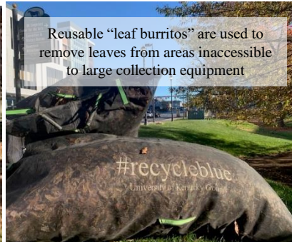
Reusable “leaf burritos” are used to remove leaves from areas inaccessible to large collection equipment