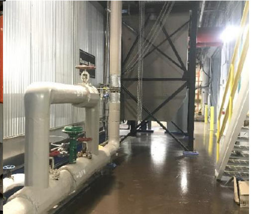
The floor at the Central Utility Plant (CUP) gleaming after a recent cleaning