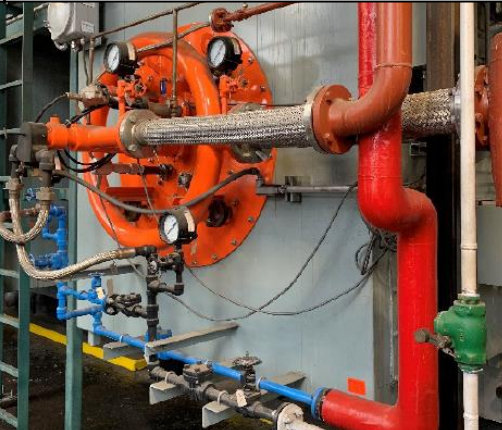
Central Boiler 32 received a tune-up and the installation of a new VFD device