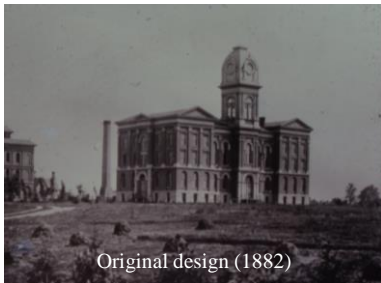
Original design (1882)