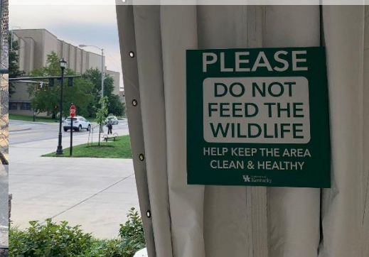
New signs in campus pavilions remind the community not to feed the wildlife.