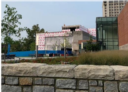
Progress continues on the Gatton Student Center Expansion project