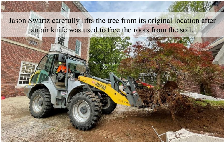
Jason Swartz carefully lifts the tree from its original location after an air knife was used to free the roots from the soil.