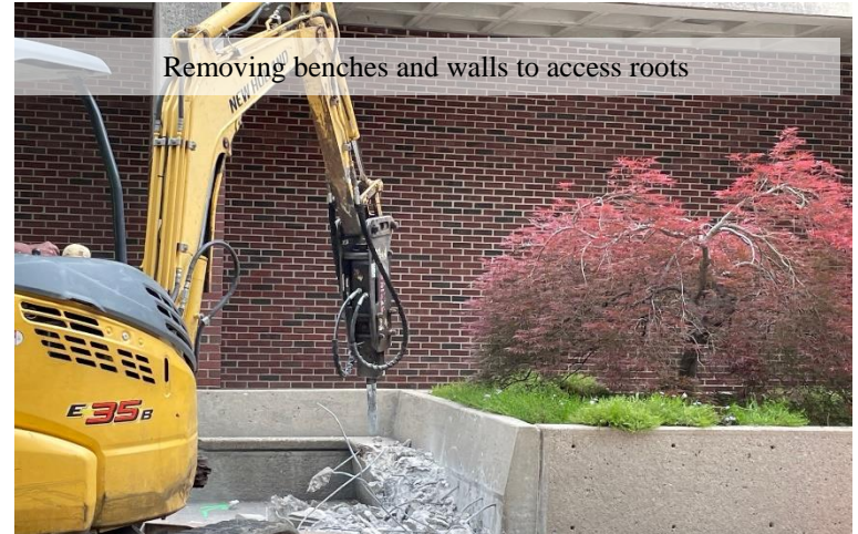
Removing benches and walls to access roots